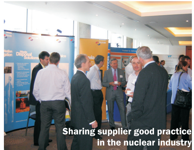
Sharing supplier good practice in the nuclear industry

SAFESPUR is linked to the SAFEGROUNDS and SD:SPUR learning networks where good practice guidance for managing contaminated land and the sustainable management of wastes on nuclear and defence sites are developed.